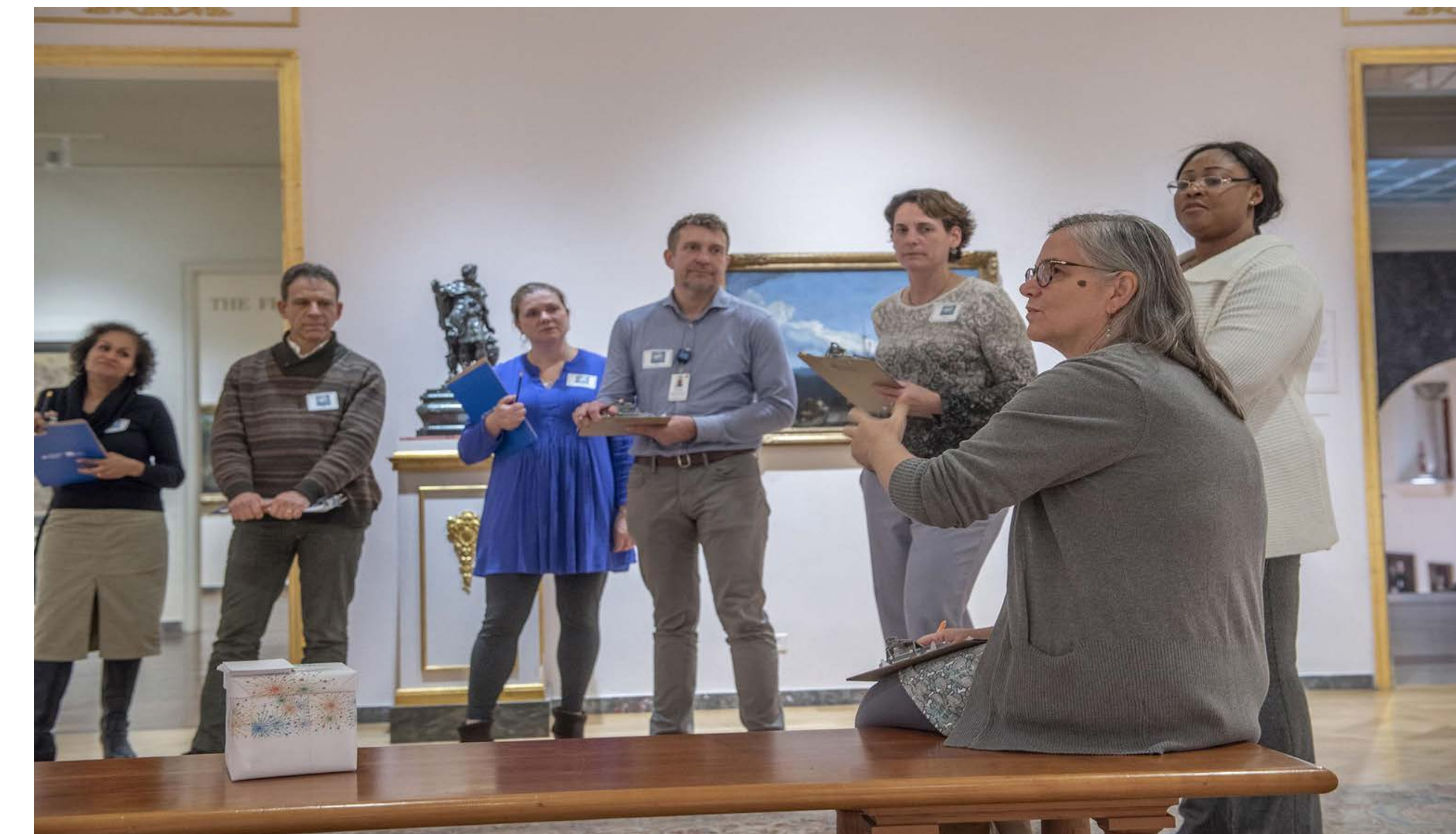
Participants debrief an exercise in one of the galleries.

Other institutions could incorporate sessions like this by engaging a Humanities-trained professional educator.