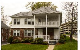
90-92 Chapin Terrace