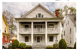
49 Pratt Street