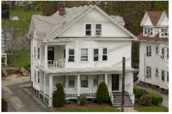
35 Pratt Street