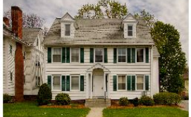
45 Pratt Street