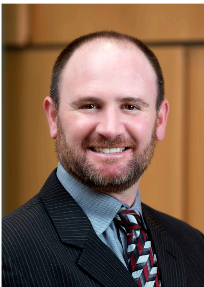
Featured in December 2022