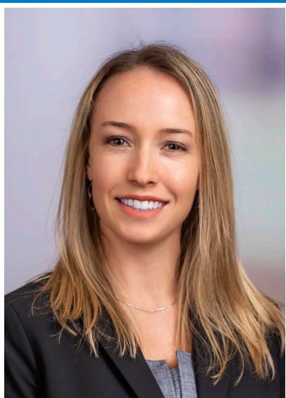
Featured in September 2022