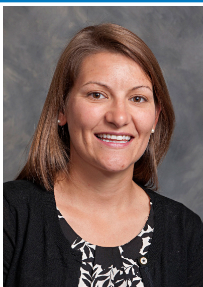
Featured in October 2022