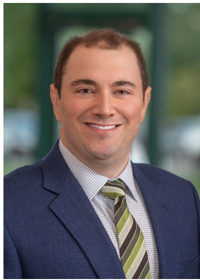
Featured in November 2022

Department of Surgery and Healthcare Delivery & Population Sciences