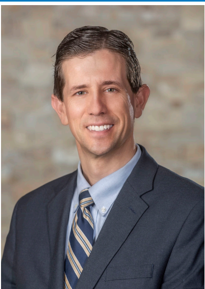
Featured in May 2022