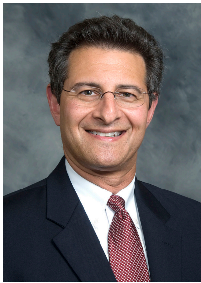
Featured in November 2022