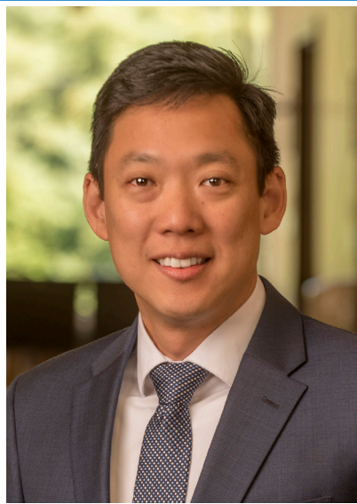
Featured in July 2022