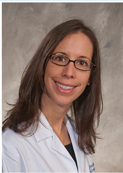
Featured in December 2022